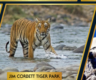
JIM CORBETT TIGER PARK