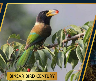
BINSAR BIRD CENTURY