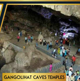
GANGOLIHAT CAVES TEMPLES